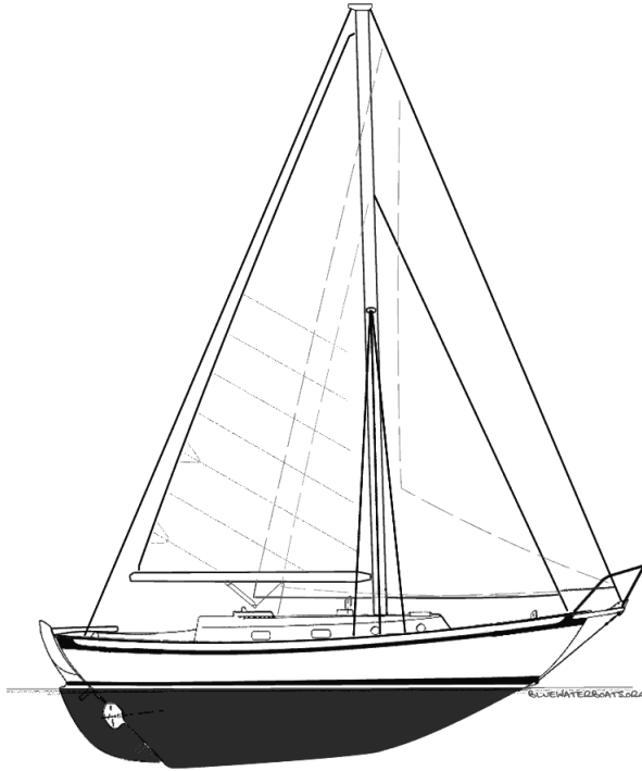
Southern Cross 31